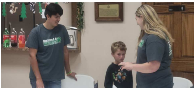
The Busy Bee 4-H Club created boxes to gather supplies for the annual Washington Angel Tree. They placed these boxes around town in local businesses. The 4-Hers picked up the boxes and contributed donations as individuals of the 4-H Club. The Angel Tree Project gives to community members who are less fortunate during the holidays.