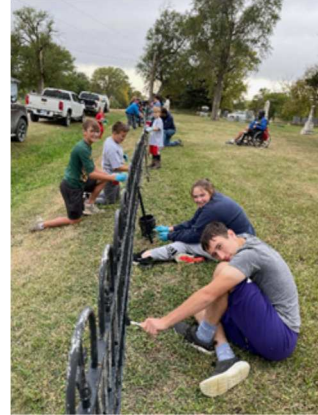
The Discovery 4-H Club painted the fence at the local cemetery in Bellville for their community service project during 48 Hours of 4-H.