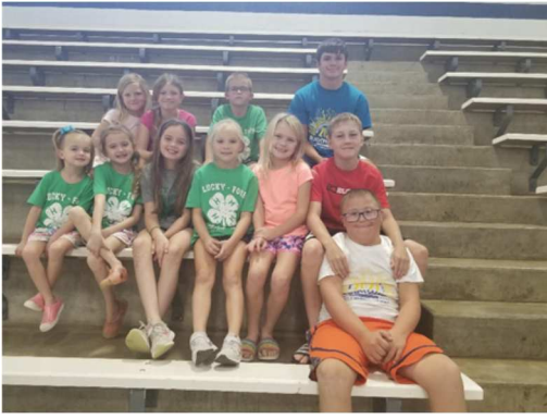
Lucky Four 4-H Club participated in 48 Hours of 4-H by helping with their local Buddy Walk in Clyde. The club helped set up and clean up for this important local event.