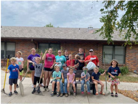
The Linn Livewires 4-H Club gave back to their local community during 48 Hours of 4-H. The 4-H youth cleaned up flowerbeds, decorated pumpkins, and made cards for the nursing home residents.