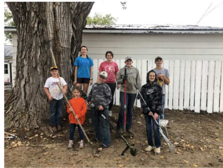
The Happy Workers 4-H Club had a busy day participating in 48 Hours of 4-H. The 4-H youth cleaned up debris and painted the back of the building and fence behind Ricky's café in Hanover.